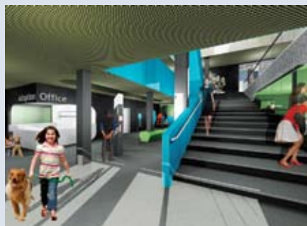
Architect's impression of new RSPCA facility.

Project manager for Buxton Construction's RSPCA project, Sweett Group, operated under the names of Padgham Sweett and BurnsBridge Sweett until being re-branded on 1 July this year. The two entities have been part of the Cyril Sweett Group since 2008 and 2009 respectively.