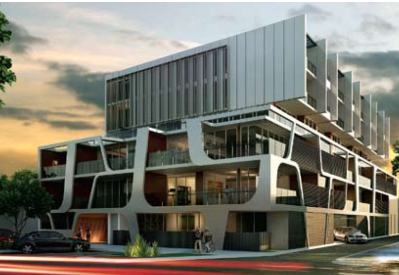
115 Nott Street, Port Melbourne.