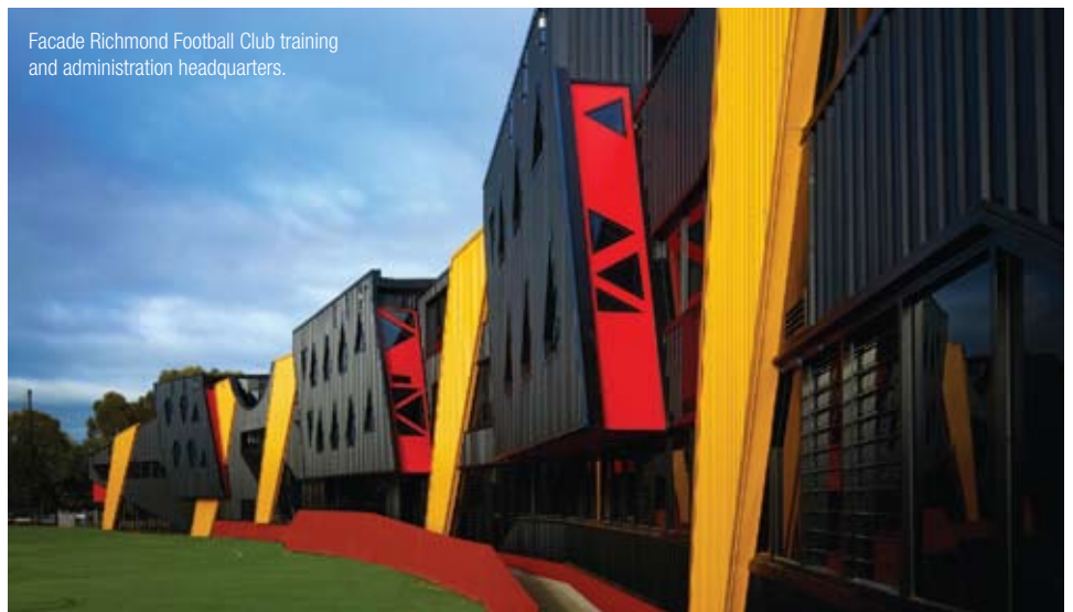
Facade Richmond Football Club training and administration headquarters.

The refurbishment of the heritage-listed grandstand – named after Tigers' legend Jack Dyer – at Punt Road Oval signalled the completion of the $14 million upgrade of Richmond Football Club's training facilities. The external improvements were primarily cosmetic and included painting and making good sections of seating. The interior of the structure was gutted and replaced by new change room facilities, locker room, a community gym and showers to meet the standard set by the Victorian Football League for the TAC Cup competition.