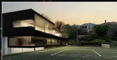
Over and out