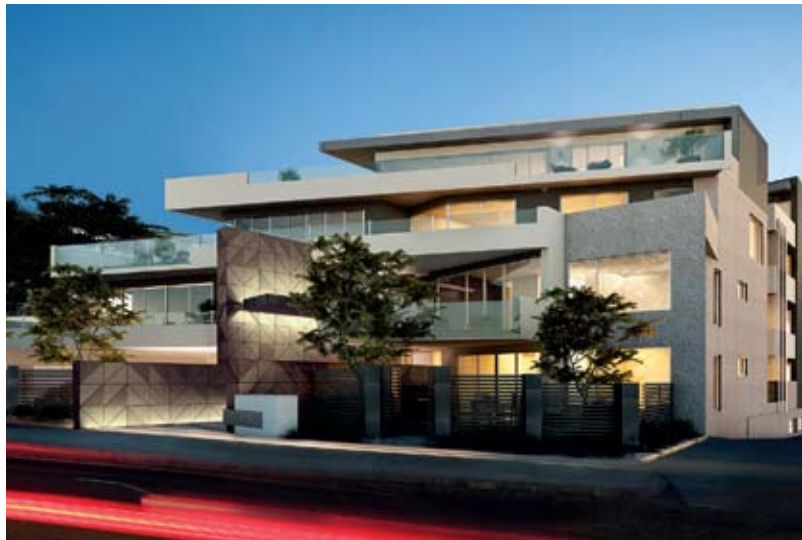
40 Harold Street, Hawthorn.