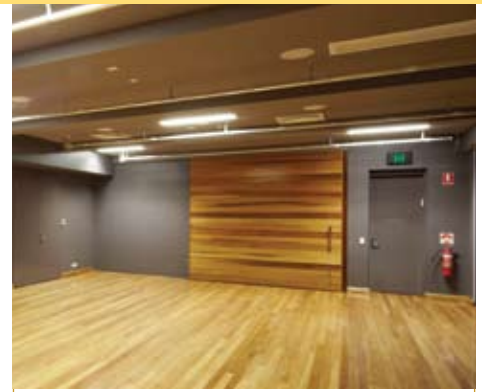
New facility at Beth Rivkah Ladies College.