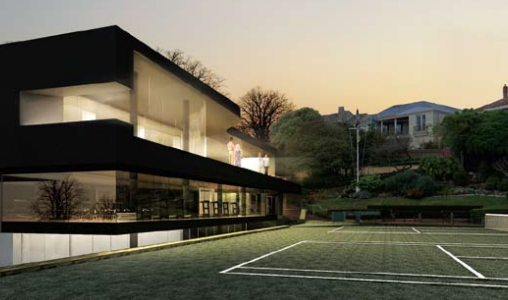
Exterior of clubhouse at Royal South Yarra Lawn Tennis Club.

Conventional pre-cast concrete panels combined with alucobond panels and stone cladding meld with extensive glazing and coloured glass screens to give the building a contemporary, but timeless facade. A timber and stone entrance foyer with double-height void is a feature of the commercial zone while two lifts service offices on all levels. Earlier this year Buxton handed over the first stage which consisted of 41 apartments, with two penthouses subsequently added to the scope.