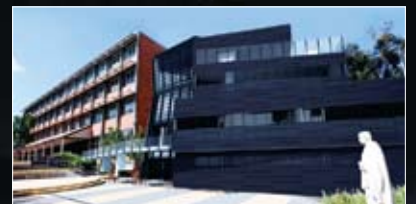
The challenges at St Kevin's College